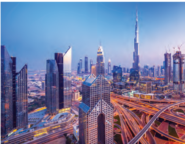
Dubai skyline at sunset, United Arab Emirates

Explore the vibrant city of Dubai, home to the world’s tallest building, the Burj Khalifa, dominating its skyscraper-filled skyline. Visit the Dubai Museum housed in the Al Fahidi Fort, the oldest existing building in the city; and be treated to an authentic desert safari. The next day, visit Abu Dhabi — capital of the United Arab Emirates — and experience everything from its beautiful mosque to its historic sites.