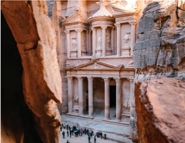
The Treasury in the ancient city of Petra, Jordan

Enhance your bucket-list cruise and land adventure and make the most of your time in this incredible region of the world before or after your 11-night Secrets of Egypt & the Nile itinerary by adding one or more of our exciting land programs below.